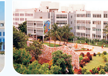
New Collectorate Office